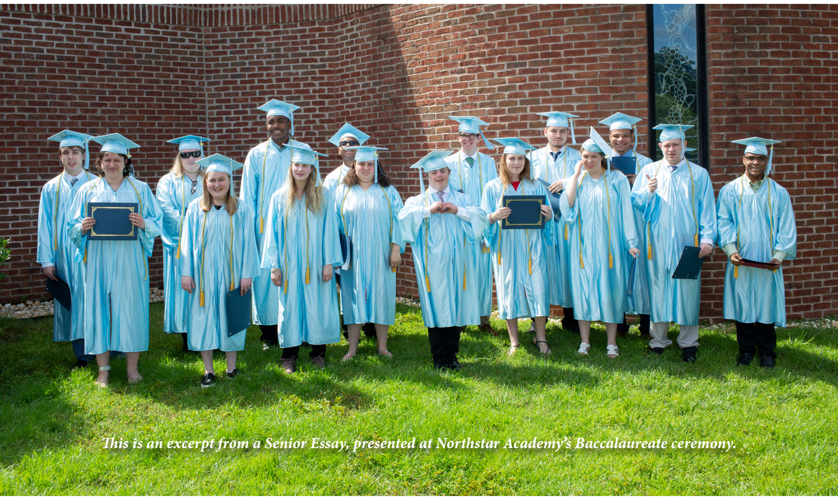
This is an excerpt from a Senior Essay, presented at Northstar Academy's Baccalaureate ceremony.

I also want to thank my friends at Northstar for always being by my side, having my back, and making me laugh. You're the best! I want to thank my aides who helped me each day, my case managers, who made sure my needs were met on a daily basis, the school nurse who never freaked out, and my driver who never left me alone when I had a seizure. And to my teachers at Northstar, thank you for being the best. You made something that wasn't easy, possible.